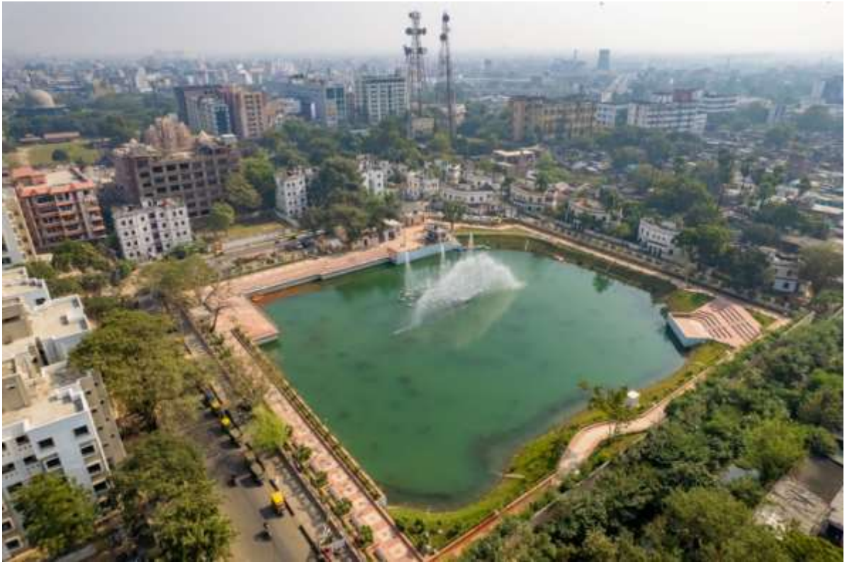
Figure 2: Site Photo