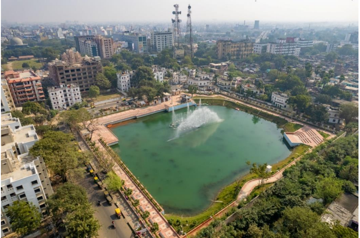
Figure 2: Site Photo